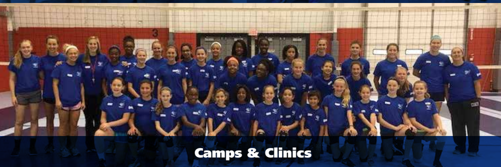
Camps & Clinics