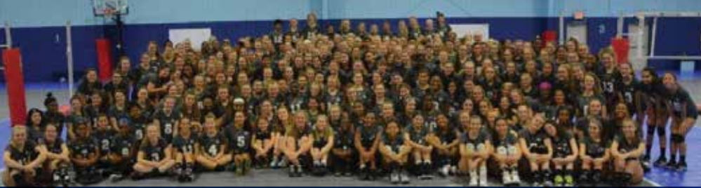
CJV Club - 2500+ Players, 200+ Teams, 100+ Coaches